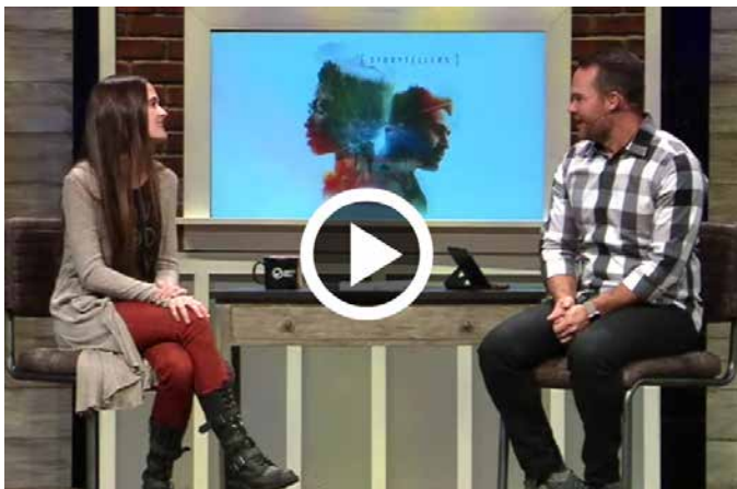
Interview at Northpoint Campus Woodstock City Church, GA http://woodstockcity.org/messages/storytellers-its-not-fair/