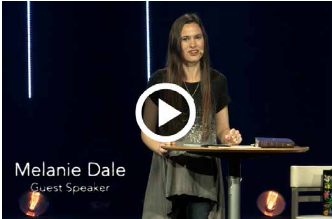
Sunday morning Mother's Day message at Crossroads Church, MN: https://vimeo.com/165773956