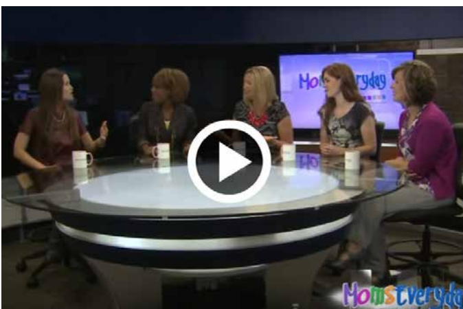
Panelist on MomsEveryday TV Show, CO: https://youtu.be/ittH73cyg-Q?t=4m18s